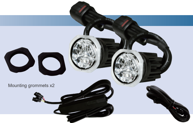
Mounting grommets x2